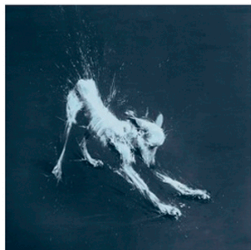
Canis Lunae Series: Big Ghost Dog