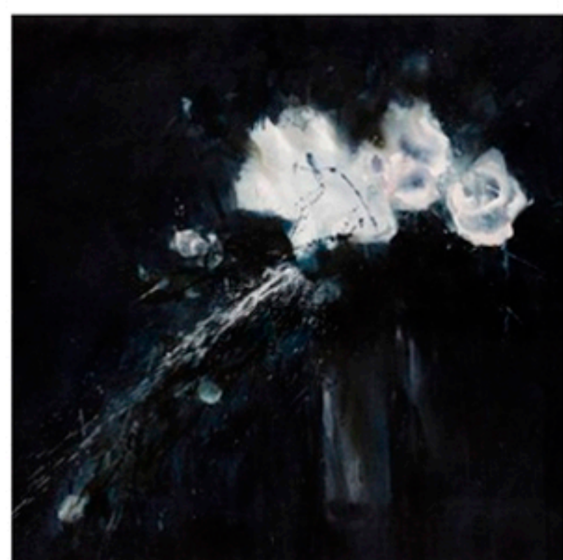
Comunion Series: After the Wedding