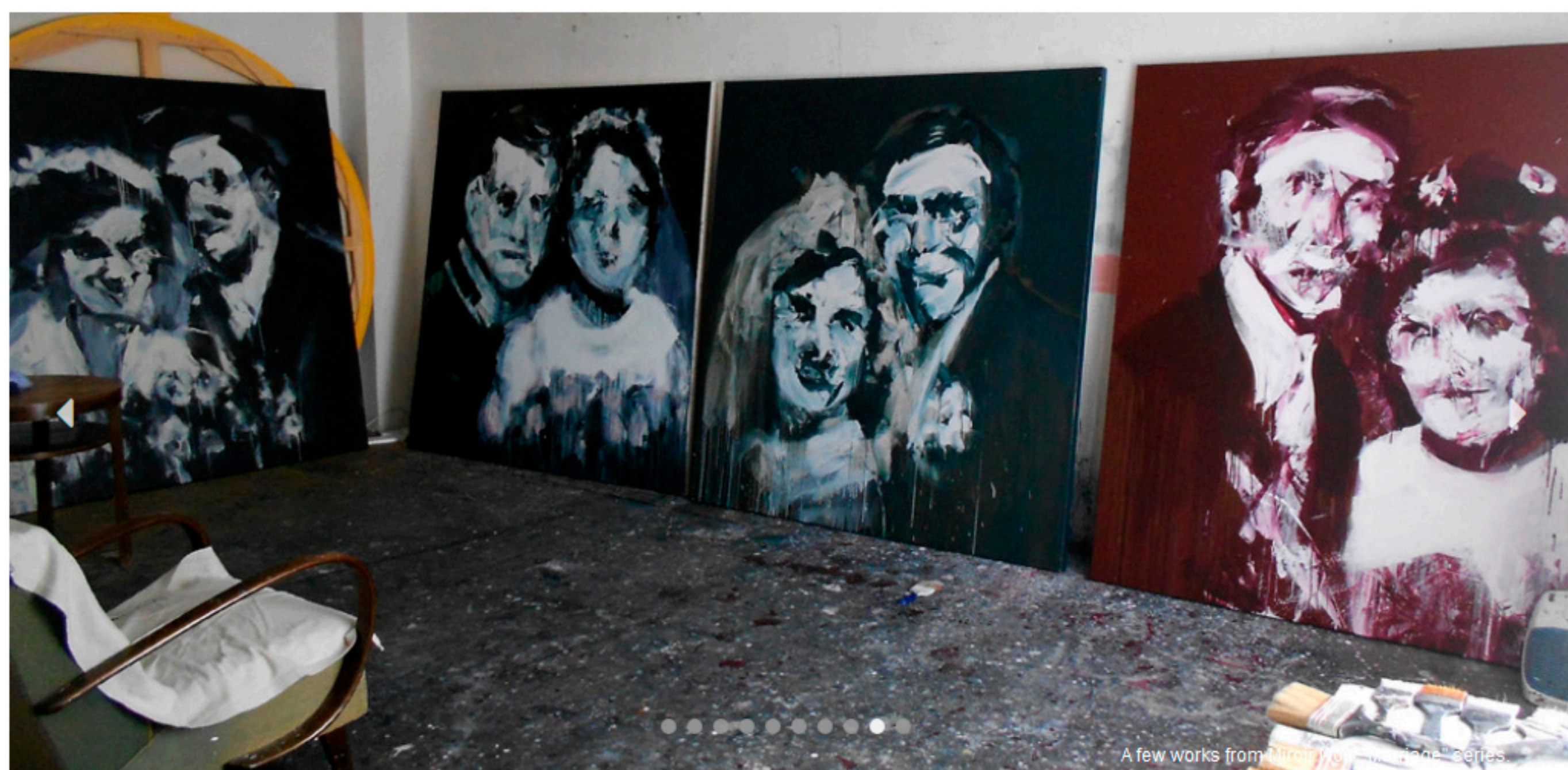
A few works from Miroir Noir's Brides Series