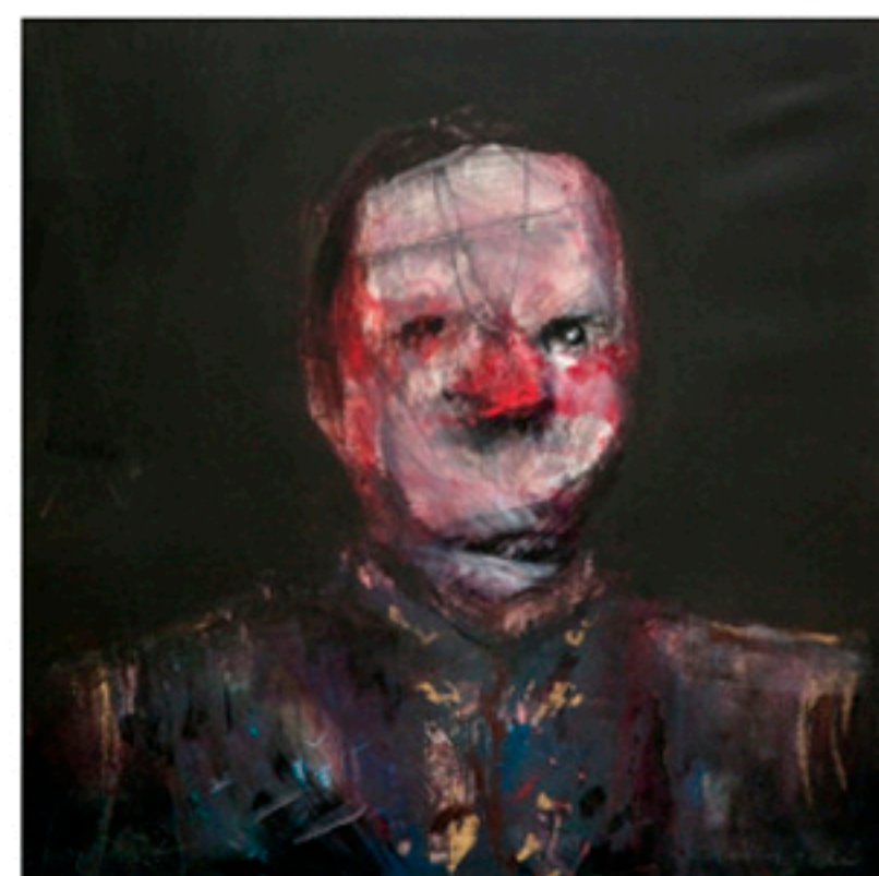
Politik Disasters Series: Napolion