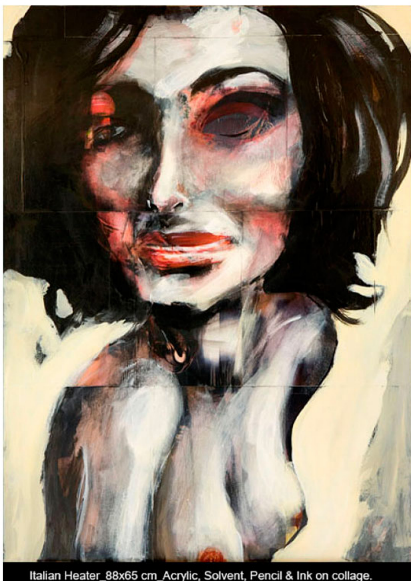
Italian Heater_88x65 cm_Acrylic, Solvent, Pencil & Ink on collage.

The best thing a journalist said was that my painting was like a punch in her stomach.